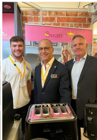
Swan x Robert Dyas