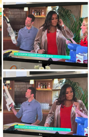
On This Morning